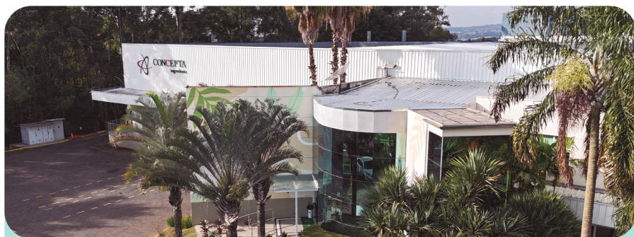
Concepta São Paulo | Valinhos